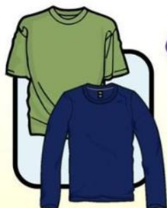
T-SHIRT OR LONG SLEEVES