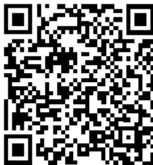
St. Joseph's Cathedral

You may also drop your weekly donations into the big wooden Collection Boxes placed at the Cathedral entrances OR do online transfer or cash deposit to St. Joseph's Cathedral Bank Account as follows: