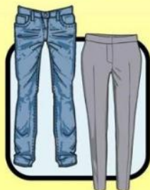
JEANS OR SLACKS