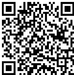
Catholic Welfare Services

DONATIONS FOR THE UNDERPRIVILEGED - Please continue to support the Catholic Welfare Services financially as we minister to the poor and needy in our midst irrespective of race or creed. You may donate to C.W.S. via S Pay Global by scanning this QR code. Verify that the recipient is ' Catholic Welfare Services ' before confirming the transaction. Donations can also be made via online transfer or cash deposit to the following: