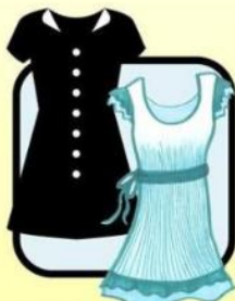
KNEE-LENGTH DRESS WITH SLEEVES