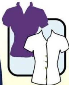
BLOUSE WITH SLEEVES