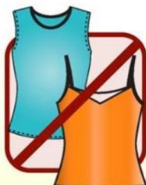
SLEEVELESS AND PLUNGING NECKLINES