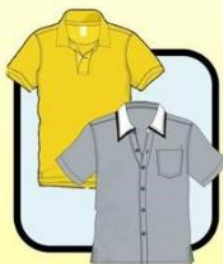
POLO SHIRT OR COLLARED SHIRT