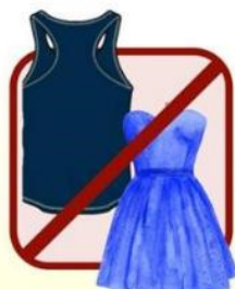
TUBES AND RACERBACKS